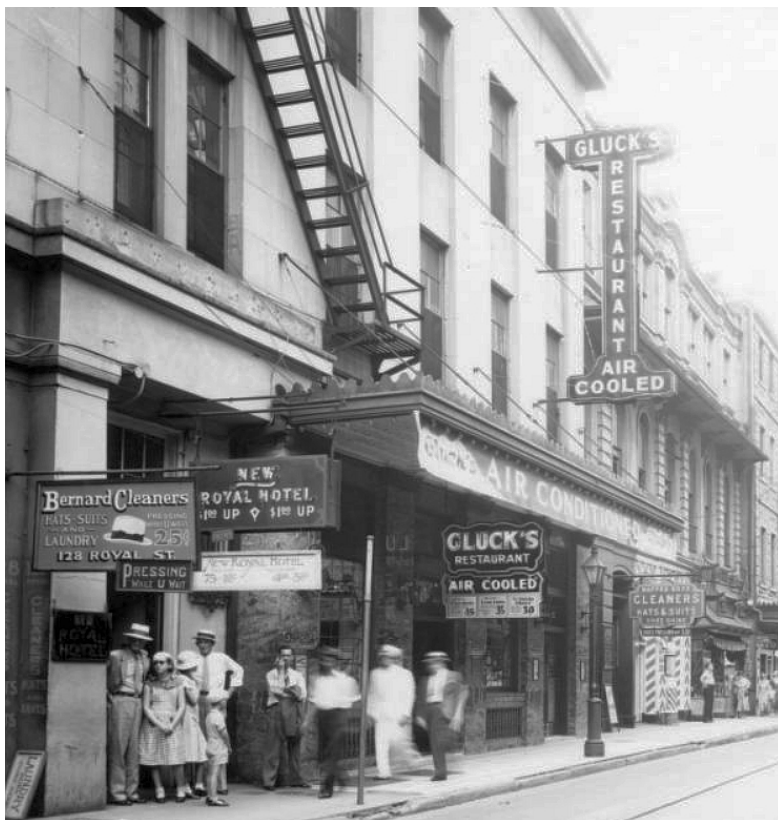
Former Merchants' Exchange's Royal Street storefronts pictured in the late 1920s.

livered to the Exchange Place entrance, “while letters in foreign languages, and those addressed to ladies, were delivered in Royal Street.”) There was also a bar-room right next to the Post Office, which surely benefitted from the foot traffic, and offices leased to various agencies and enterprises. The second floor had a popular Reading Room stocked with the latest tomes and newspapers and frequented by a loyal patronage paying $10 annually. “There are two bulletin boards in the room,” reported the Daily Picayune in 1840, “one for ship...arrivals and clearances; the other...containing the latest and most important news.” For years the second floor also housed a city court and the Federal District Court, and it was here in 1857 that filibuster William Walker was tried and acquitted for violation of neutrality laws in his notorious adventurism in Nicaragua. On the third floor was a Billiard Club and parlors for chess games, smoking, and general socializing, all with the business of business at hand. (As for Gallier and Dakin’s original skylight, it had been destroyed by a lightning bolt in 1841 and replaced with tin.)