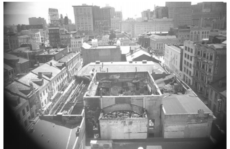
Ruins of the Merchants' Exchange after the 1960 fire, with Royal Street at right