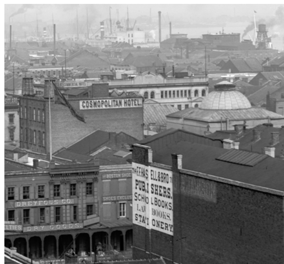
LEFT: Merchants' Exchange dome visible at right of this detail taken around 1900. TOP: Longitudinal section of the Merchants' Exchange

Opened in 1836, the Merchants' Exchange would host a head-spinning array of uses, programs and occupants. In today's parlance, it was "shared space:" flexible public space held in the private domain for multiple users day and night. In addition to auction rooms, meeting areas and trading floors, the ground floor hosted the U.S. Post Office, a key tenant that made the building relevant and known to all. (Curiously, according to the Daily Picayune , letters in English were de-